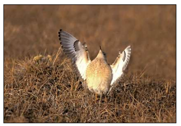
Buff-breasted Sandpiper performing a double wingwave at a tundra lek site to attract females.