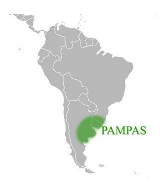
The Pampas is an extensive treeless plain in South America.